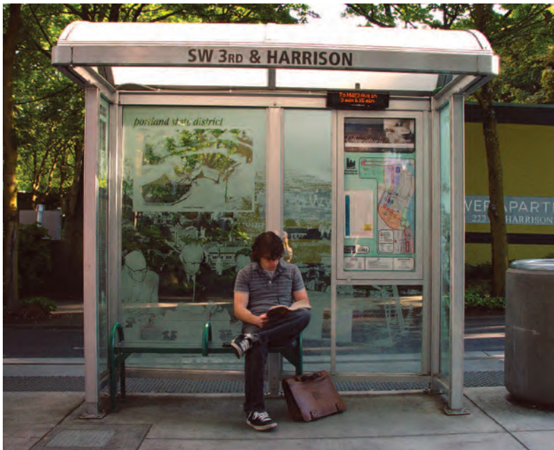
PSU District shelter

Interpretive Portland history etched in the glass of Portland Streetcar shelters.