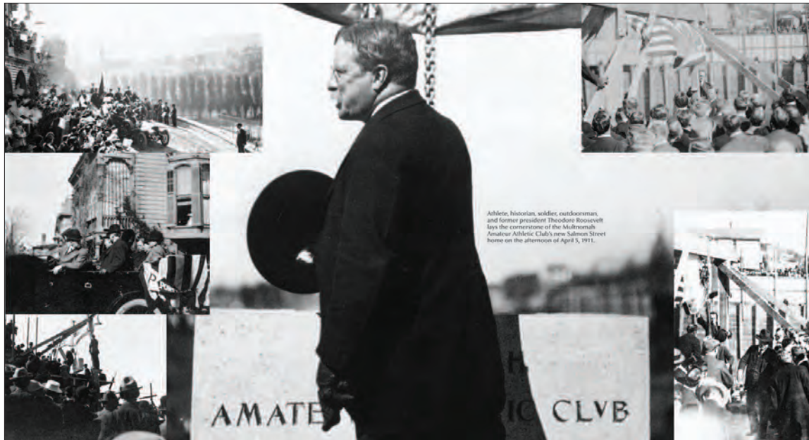
Roosevelt at the Multnomah Athletic Club