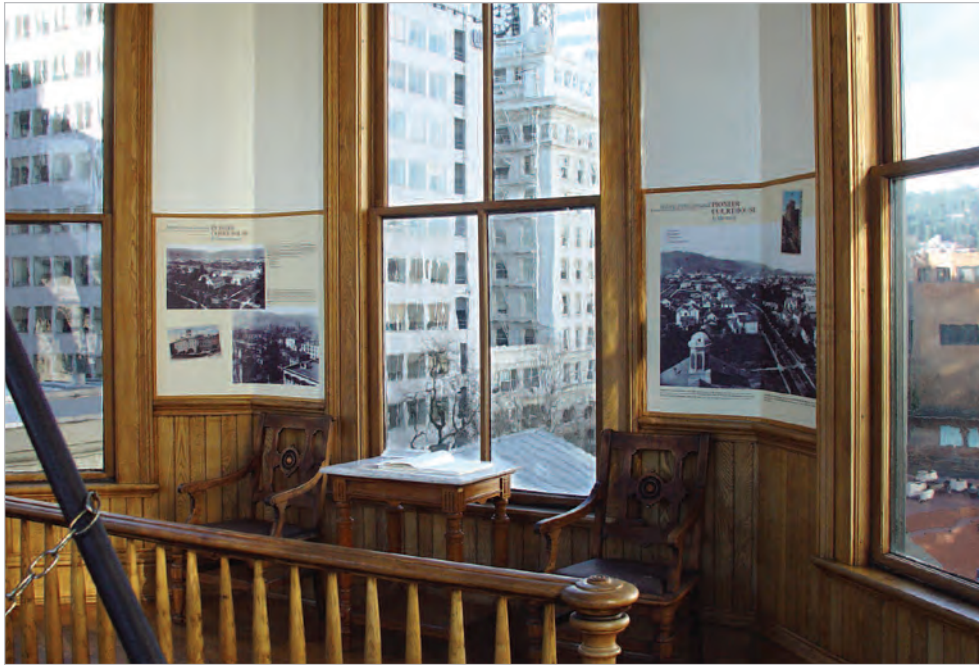
Exhibit panels showing historic views out the windows of the Pioneer Courthouse cupola