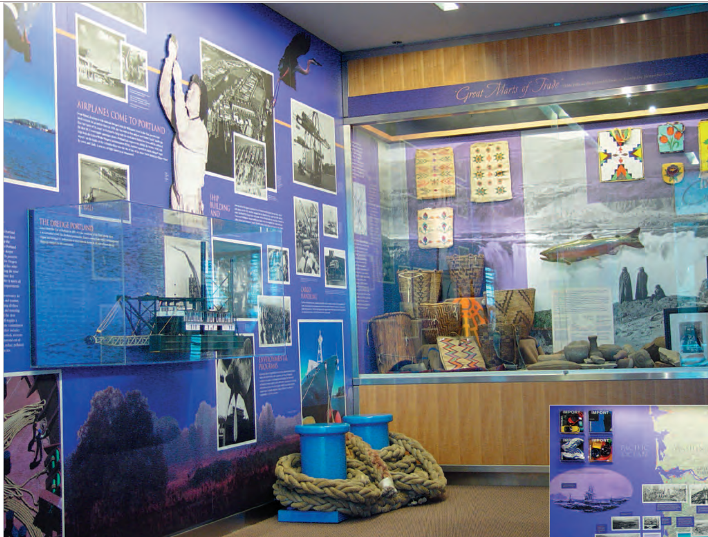
Mighty Columbia exhibit in the Portland International Airport 2001-2010