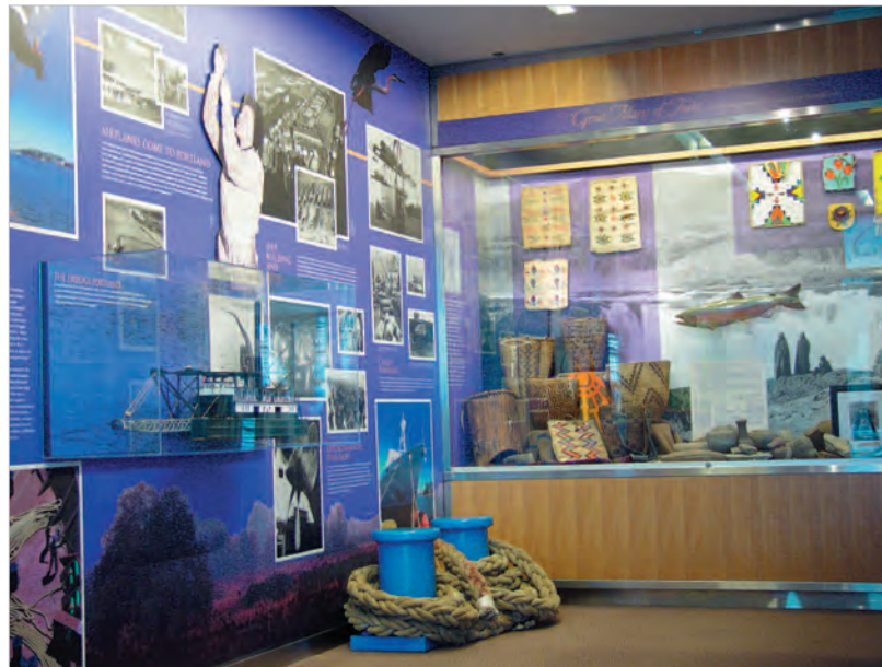
exhibit design portfolio

in collaboration with Chet Orloff, Oregon History Works