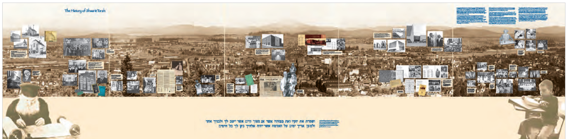
Shaarie Torah History Wall