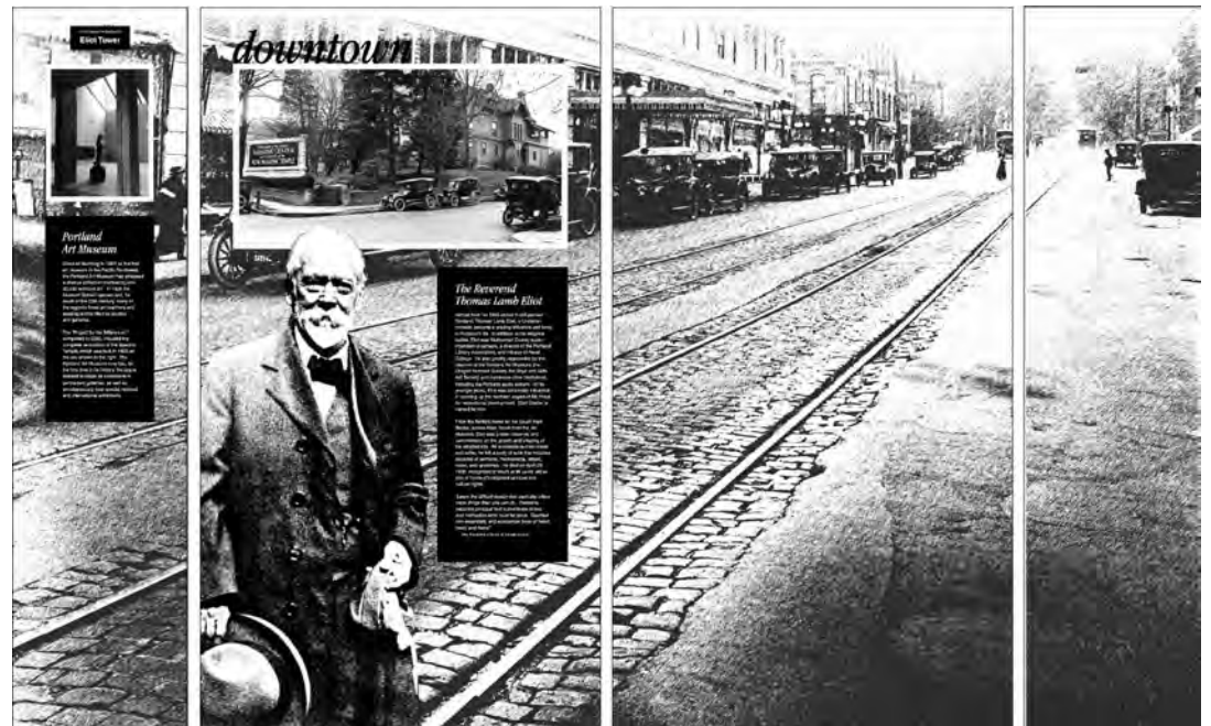
Downtown District shelter