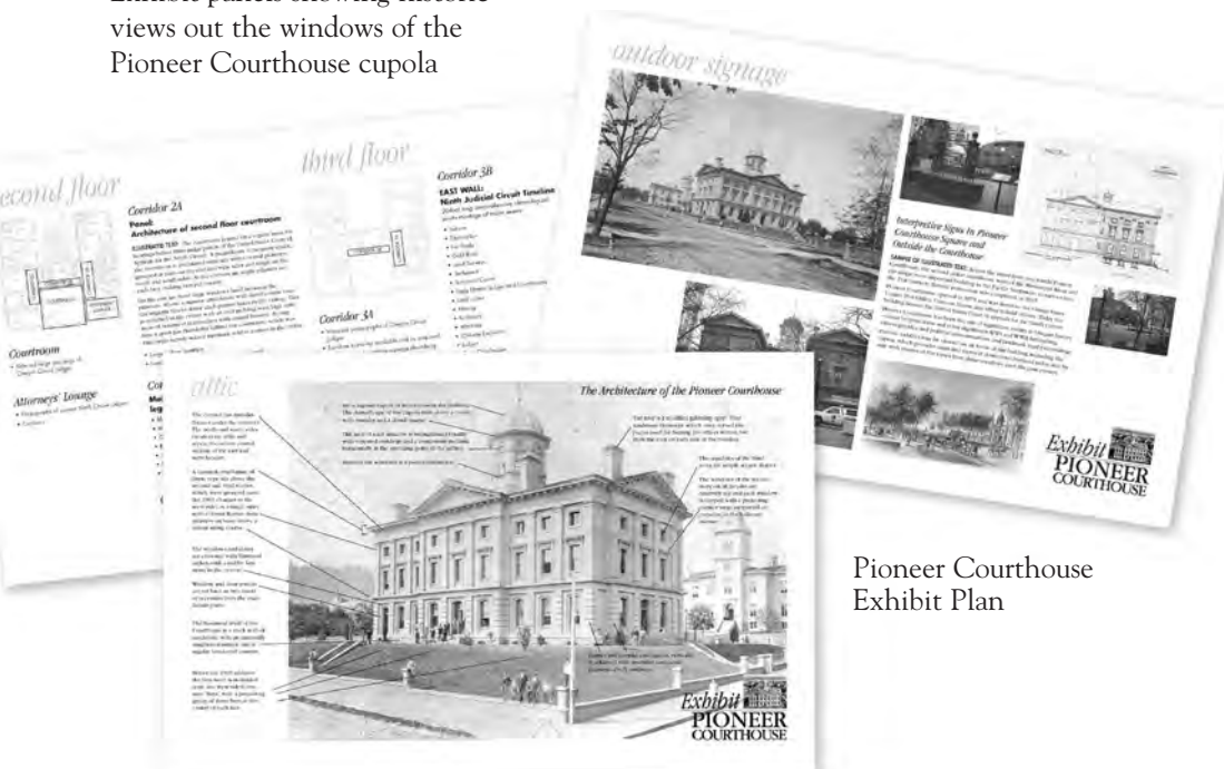
Pioneer Courthouse Exhibit Plan