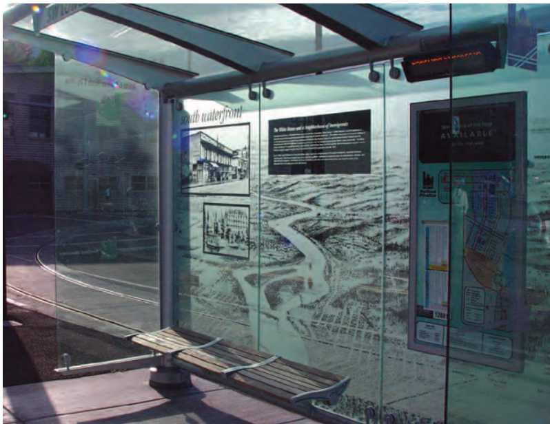
South Waterfront shelter