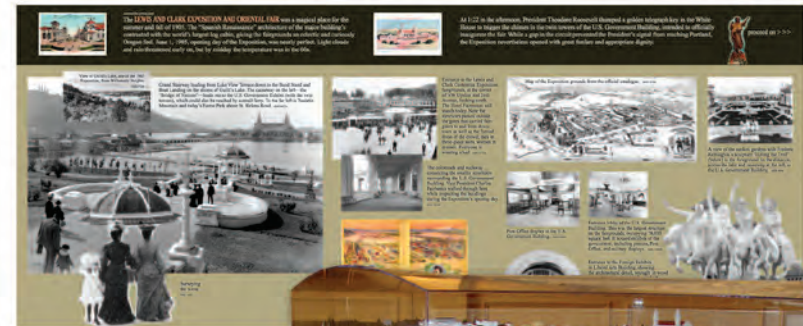
Scale Model of the 1905 Lewis & Clark Centennial Exposition and Oriental Fair